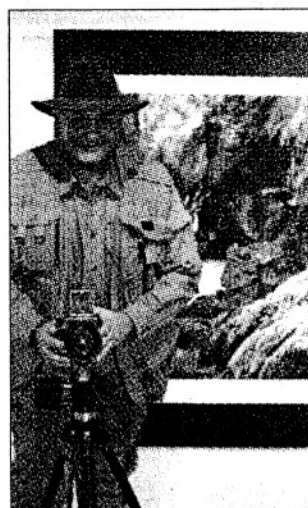
ROGER MOORE POSES in front of a photo of his.

TOSH is open from 10 a.m. to 5 p.m., Monday through Saturday, call 752-6133 for information.